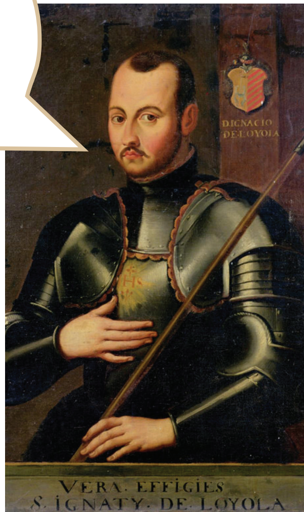
Saint Ignace de Loyola (1491-1556), fondateur de l'ordre des Jésuites