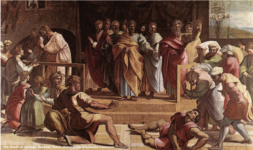
The Death of Ananias, Raphael

A man named Ananias, however, with his wife Sapphira, sold a piece of property. He retained for himself, with his wife's knowledge, some of the purchase price, took the remainder, and put it at the feet of the apostles. But Peter said, "Ananias, why has Satan filled your heart so that you lied to the Holy Spirit and retained part of the price of the land? While it remained unsold, did it not remain yours? And when it was sold, was it not still under your control? Why did you contrive this deed? You have lied not to human beings, but to God." When Ananias heard these words, he fell down and breathed his last, and great fear came upon all who heard of it. (Acts 5:1-5)