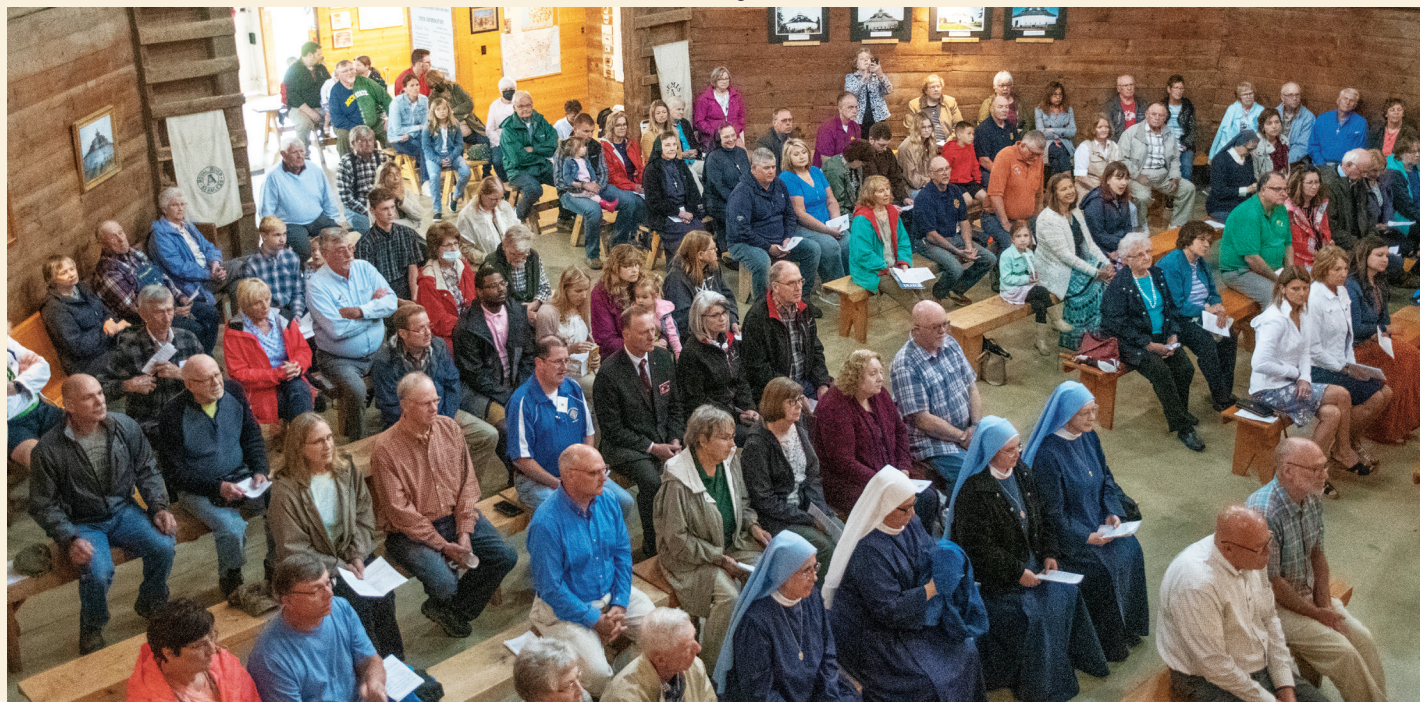
Area Catholics filled the Thumb Octagon Barn to celebrate a Rural Life Mass on May 21.