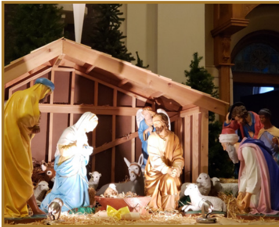
Holy Family Church