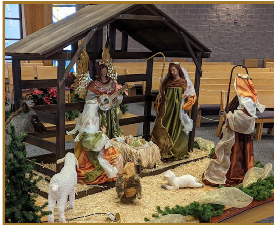
St. Agnes Parish