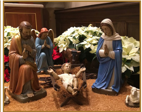
St. Mary's Cathedral