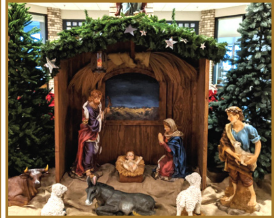
Blessed Trinity Church