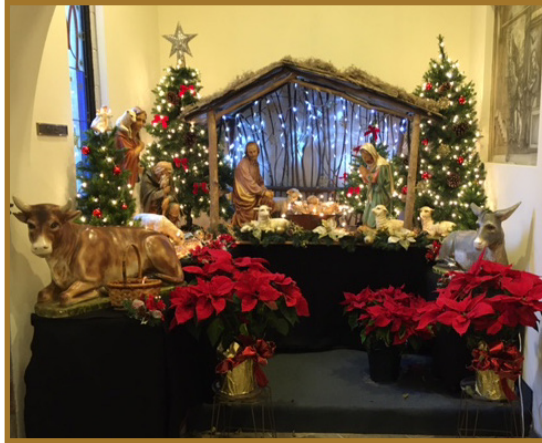
Ave Maria Parish

https://ccfmm.org/ ccfmm-nativity-gallery/